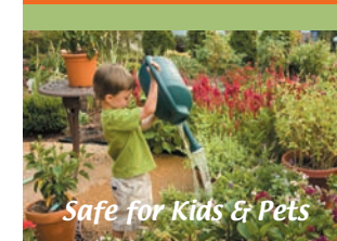
Safe for Kids & Pets