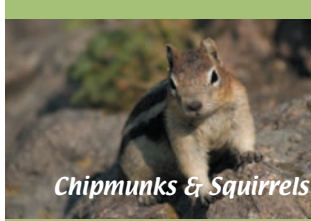
Chipmunks & Squirrels