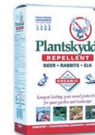
Soluble Powder Concentrates