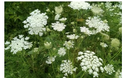
Wild Carrot (Queen Anne's Lace)