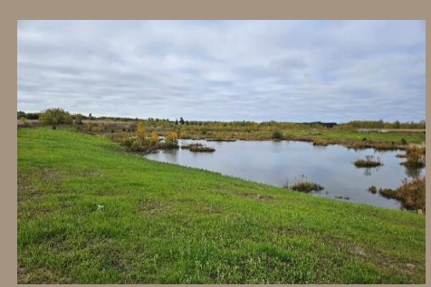
iBrandl Eisenhower Nonmetallic Site Reclaimed