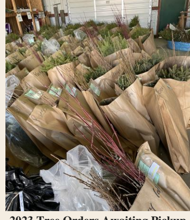
2023 Tree Orders Awaiting Pickup