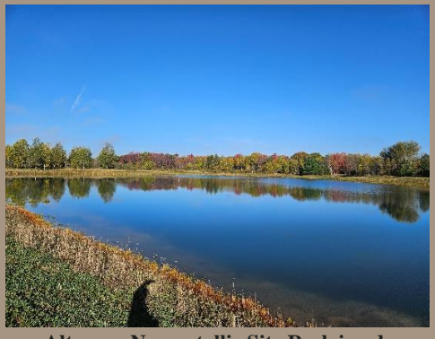
Altmann Nonmetallic Site Reclaimed