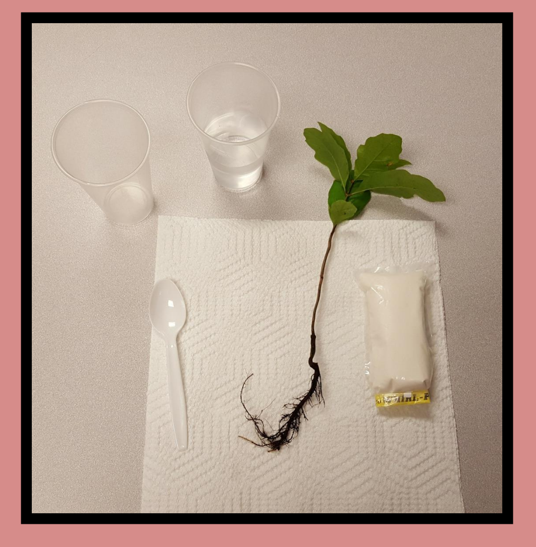
1. Gather gel packet, a bucket, stirrer, water, and plant with bare roots.

Generic gel is a starch absorbent that retains water and gives it back to the plant during dry periods. The gel increases plant survivability. It is available in 4oz. (good for 250 transplants), 1 lbs. (good for 1,000 transplants), and 3 lbs. (good for 3,000 transplants and 12,000 seedlings. A little goes a long way!