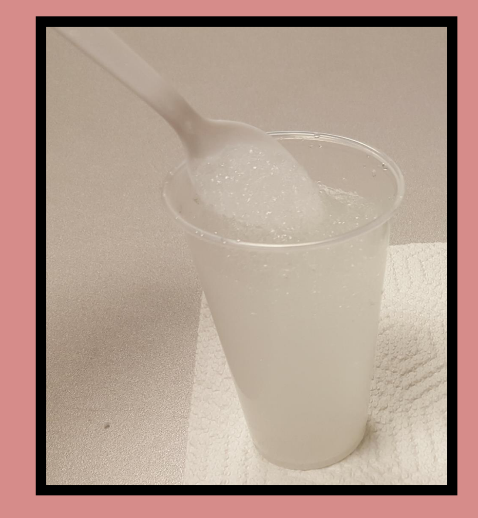
3. Add water as needed to the mixture until it is the consistency of light gravy.