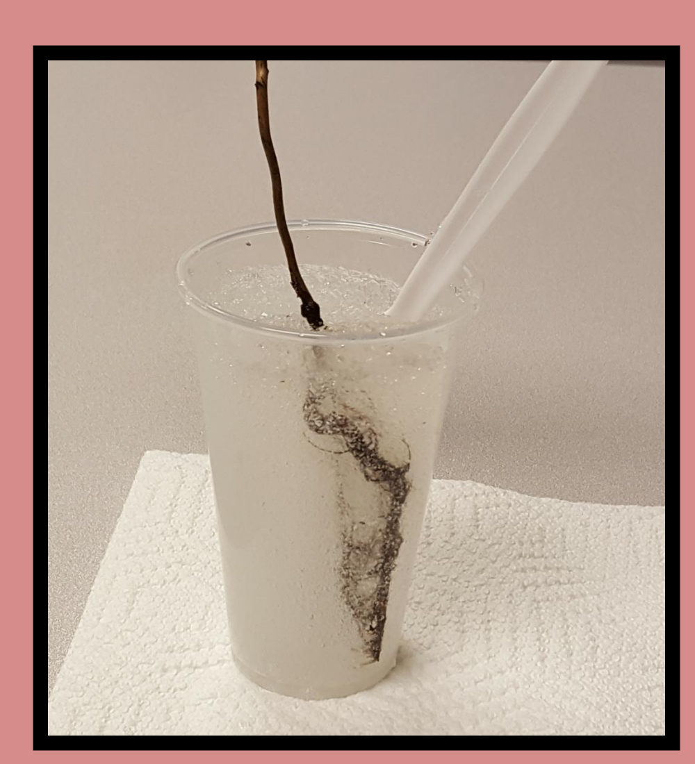
4. Dip ALL of the plant roots into the mixture. ** DO NOT dip the plant stem into the mixture.

2. Drive stake into the ground approximately 1\frac{1}{2} " from the